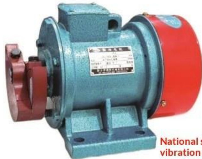
National standard three-phase vibration motor

Salt), pharmaceuticals, grain processing, vibration finishing machines, shot blasting machines, shakeout machines, fitness equipment, electronic products, etc.